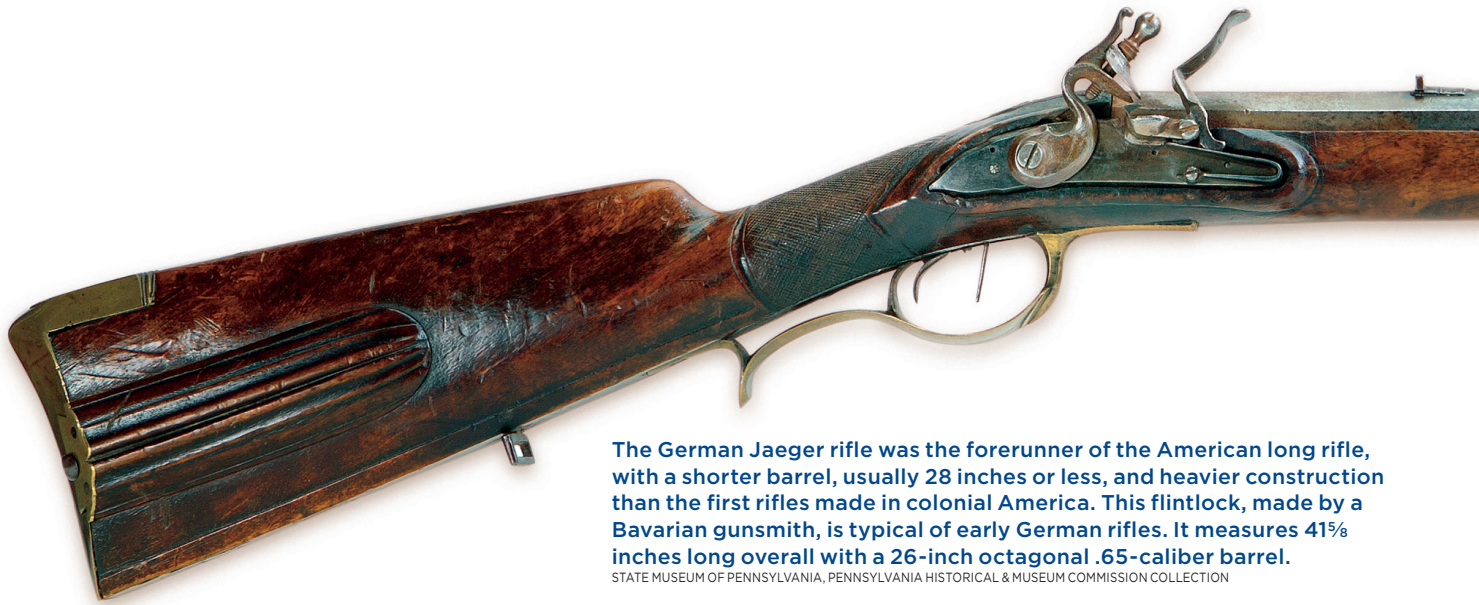
The German Jaeger rifle was the forerunner of the American long rifle, with a shorter barrel, usually 28 inches or less, and heavier construction than the first rifles made in colonial America. This flintlock, made by a Bavarian gunsmith, is typical of early German rifles. It measures 41 \frac{3}{8} inches long overall with a 26-inch octagonal .65-caliber barrel.

STATE MUSEUM OF PENNSYLVANIA, PENNSYLVANIA HISTORICAL & MUSEUM COMMISSION COLLECTION