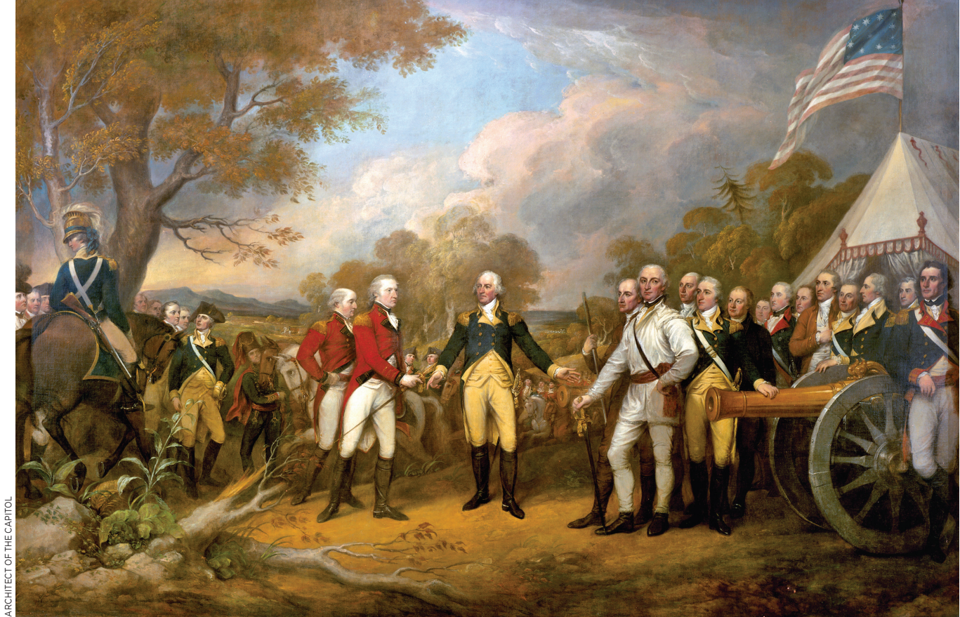
ARCHITECT OF THE CAPITOL