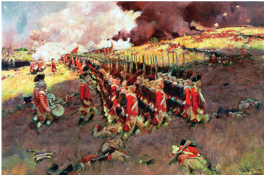
The Battle of Bunker Hill , painted c. 1897 by Howard Pyle, depicts the traditional European method of warfare, in which three rows of soldiers march in straight lines toward the enemy until the first-row men unleash a simultaneous volley of musket fire. (Because of uneven ground and obstacles in America, the British adapted the method to two rows spaced farther apart. Also likely inaccurate is the presence of drummers.) The painting appeared in the February 1898 issue of Scribner's Magazine . The original was owned by the Delaware Art Museum until its apparent theft in 2001.

scouting, skirmishing, and screening duties for the main army.